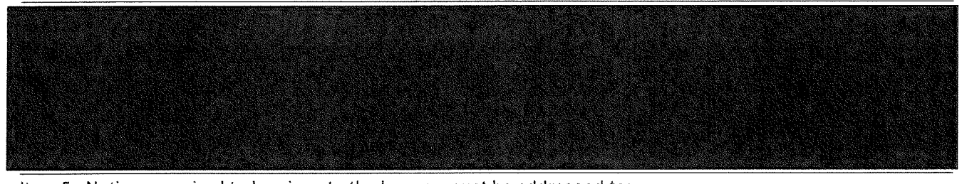
Item 5. Notices required to be given to the Insurer must be addressed to:

At 12:01AM Standard Time at your Mailing Address Shown Above